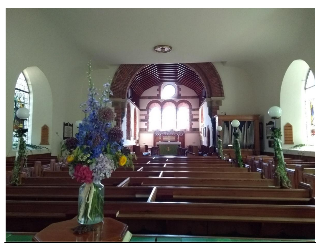
Inside St. Peter's Church