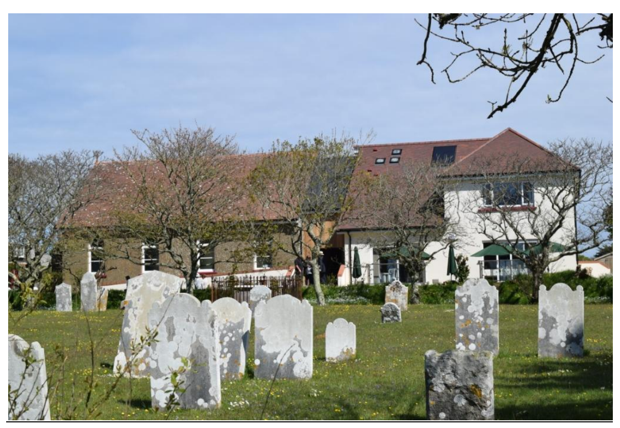
Sark Sanctuary Centre and Chapel