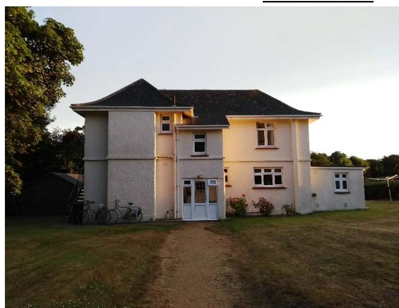
Vicarage - front