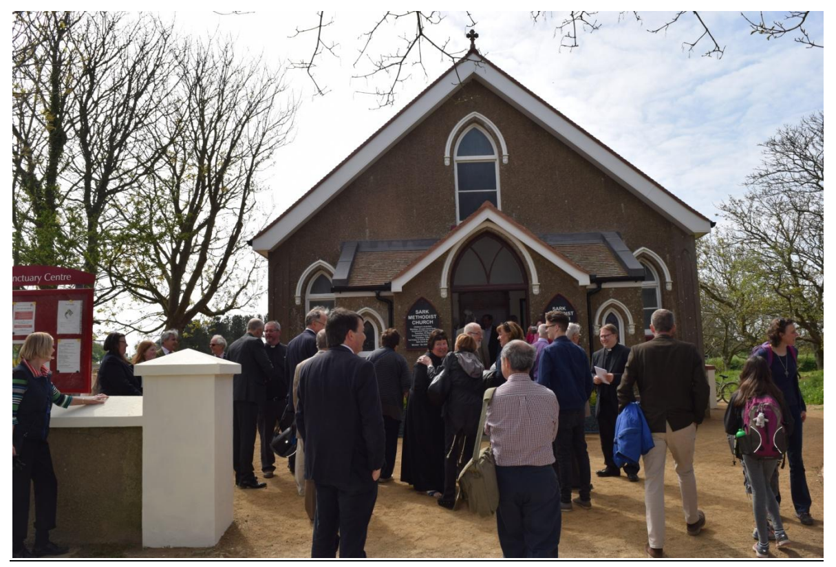
Sark Methodist Chapel - opening of Sanctuary Centre April 2017