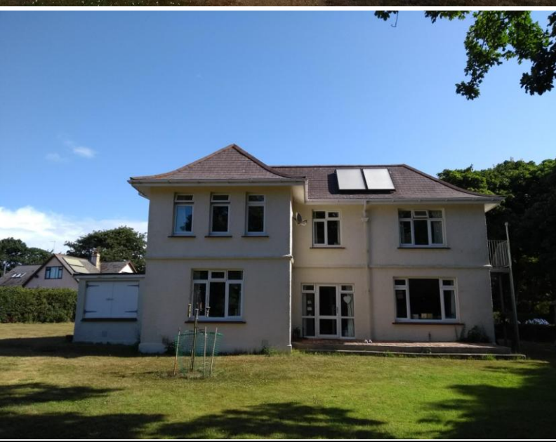
Vicarage - rear